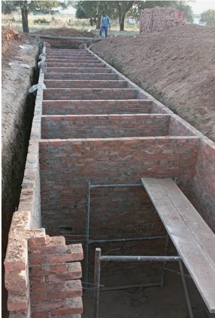
New toilet block (for students) under construction: foundations and septic pit(3m deep) for 14 toilets; both toilet blocks (students and staff) are expected to be completed during July/August 2022.