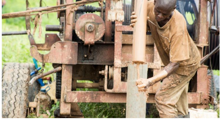
Drilling of boreholes commenced in February; water was struck at both schools promising good water supply for years to come