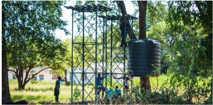
Water stands for 2x 5,000l tanks at each school: constructed and tanks hoisted on top of stands to gravity feed reticulation pipes; Local authorities are still to conduct a final inspection before the system can be “handed-over” to the schools.