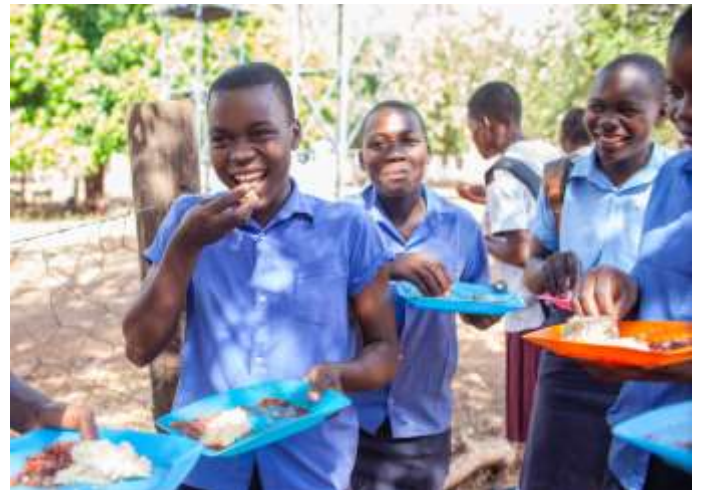
Lunchtime meals, Muzarabani High, May 2024