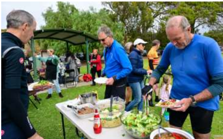
A good feed and lots of good spirit, knowing that the results were worth all the effort.