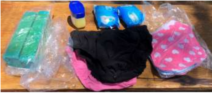
Menstrual Health starter kit – Form 1 girls

Menstrual & sexual health: In February, we helped 105 new Form 1 girls with good menstrual health by giving them starter kits with sustainable pads and underwear. After workshops on Sexual and Reproductive Health and Rights, run by our partner Sanitary Aid Zimbabwe, all girls and boys received toiletry kits.