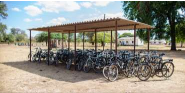
Newly built bike shelter, Hwata Secondary

School fee support: Term 1 school fees were paid for 92 students from vulnerable families (54 girls and 38 boys). This helps the kids attend school and take exams. It also gives the schools some income security, allowing them to pay for important services like internet and maintenance work.