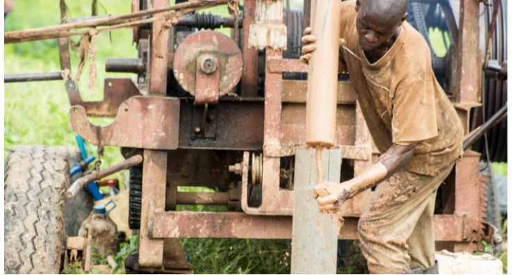
Drilling of boreholes commenced in February; water was struck at both schools promising good water supply for years to come