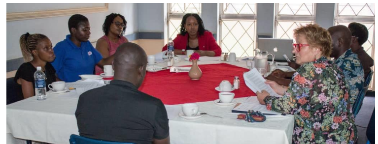
Planning workshop with local team in Harare, 8 March 2022