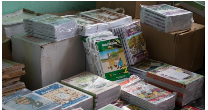
Textbook delivery for Hwata Secondary – prior to hand-over