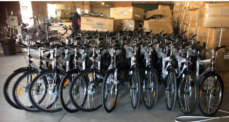
Sturdy bikes, designed for conditions in rural Africa – in warehouse of Buffalo Bike / World Bicycle Relief in Harare

We appeal to you to help us raise the required funds.