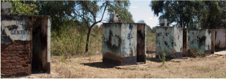
Existing student toilets at Hwata Secondary School – described as “death traps, waiting for an accident to happen”