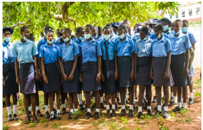
Students performing a Thank-you song – thanking supporters of NoBarriers.

Please send email informing of the transfer